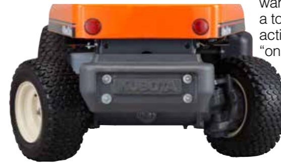
Kubota's bevel gear 4WD system provides a tight turning radius and delivers smooth power transfer to the wheels, even during sharp turns.

want to power through a tough spot, simply activate temporary "on demand" 4WD by pressing and holding the two designated pedals simultaneously.