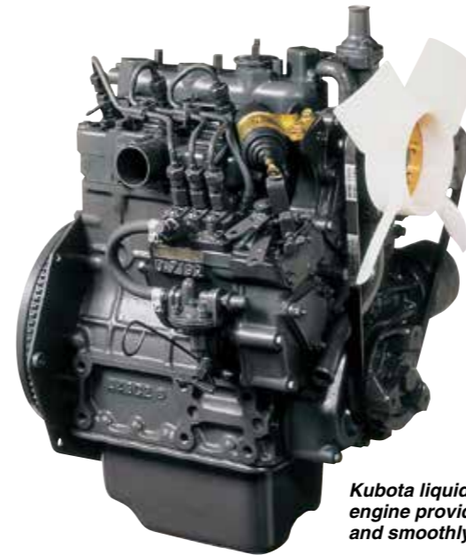
Kubota liquid-cooled, 4-cycle 3-cylinder diesel engine provides plenty of torque to recover fast and smoothly from sudden load increases.

The 16.6-horsepower diesel engine in each of these front mount tractors provides high torque rise to handle tough mowing jobs, even in thick grass. Fuel economy is superb with Kubota's Three Vortex Combustion system (TVCS). You get cleaner exhaust and quiet operation. Rubber engine mounts minimize vibration, and cooling air is discharged to the rear, away from the operator. Power travels by shaft drive from the PTO to the mower deck. The mowing blade's multi-belt system is very durable.