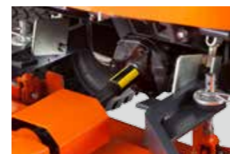
The shaft-drive PTO delivers more cutting power to the mower with fewer problems than belt drive systems.

The hydraulic wet-type multiple-disc PTO clutch is the first in this class. Very durable, it engages smoothly with reduced shock and needs less maintenance. No belts or pulleys are needed.