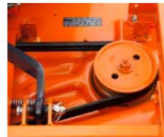
The multi-belt drive system provides outstanding durability with a double-V Belt, on the 48-, 54- and 60-inch side-discharge mower decks.

The Kubota GF1800 (4WD) and GF1800E (2WD) combine the rugged durability of a larger front-mount tractor with the versatile mobility and easy, economical operation of a compact. Their lighter, more compact design makes maintenance fast and easy to perform as well. Attachments such as snowblowers and blades can be added to make these front tractors real multi-purpose performers.