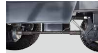
The innovative design of Kubota's rear-wheel horizontal drive shaft reduces wear and enhances durability. It also permits secure power transfer to the rear wheels when in 4WD.

When you release the pedals, 4WD disengages. The bevel-gear system in the GF1800 is similar to that found on Kubota's larger F-Series front tractors. This system tightens your turning radius and delivers smooth power transfer to the wheels, even during sharp turns. Commercial operators who push their mower to the limit will appreciate the GF1800's durability and performance values. This is a tough front mower that will increase your overall work efficiency.