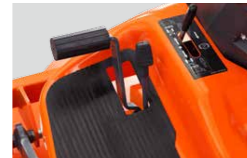
Foot-actuated 4WD provides either continuous or "on demand" ground-hugging traction with the simple touch of your foot on-the-go.