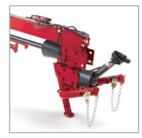
Two-Point Swivel Hitch